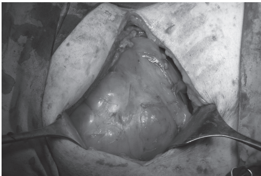
Figure 1 – Solitary fibrous tumor in the retroperitoneum.

A 72-year-old man was admitted to our hospital with one-month history of mild pain in his left flank, without gross hematuria or other constitutional symptoms. Physical examination revealed a palpable right flank mass. Laboratory data of blood and urine, including cytology, were within normal limits. A computed tomography (CT) scan of the abdomen showed a well-delineated mass arising from the upper pole of left kidney measuring 7×6 cm with contrast enhancement. The patient underwent left radical nephrectomy with a presumptive diagnosis of renal cell carcinoma (RCC). The pathologic diagnosis of the nephrectomy specimen was that of a solitary fibrous tumor with negative surgical margins and no infiltration of the perinephric fat or Gerota's fascia. Neither chemotherapy nor radiation therapy