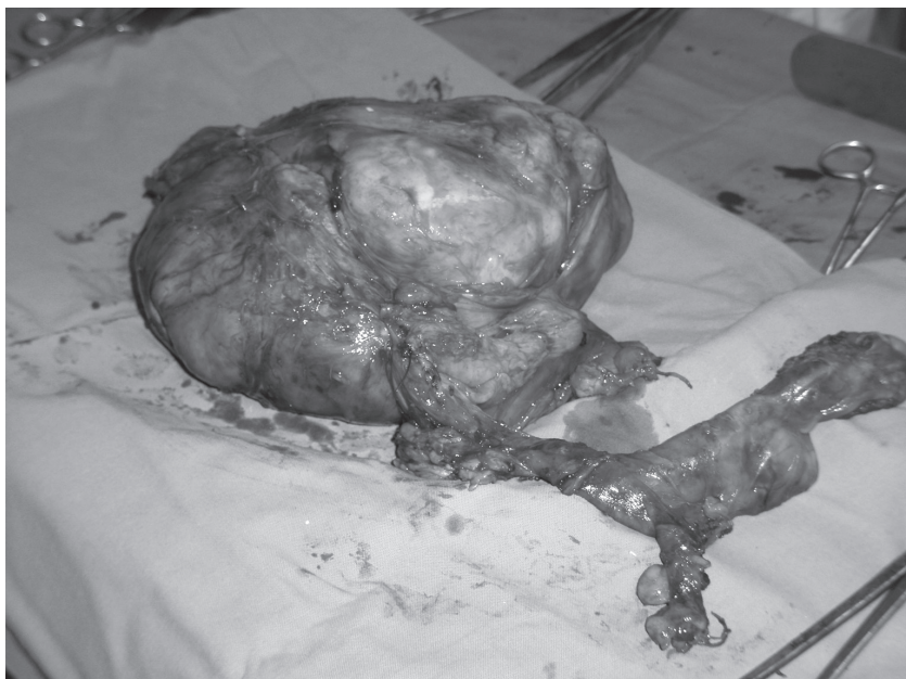
Figure 3 – The second part of the excised tumor.