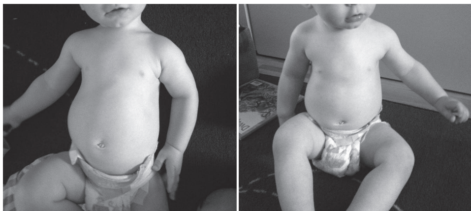
Figure 2 – The 10-months old boy (patient 1) with asphyxiating thoracic dysplasia and narrow chest circumference 40.5 cm (age related controls 46.7 cm) due to heterozygous mutations c.4458delT ( p.Phe1486Leufs*11 ) and c.9044A>G ( p.Asp3015Gly ) in DYNC2H1 gene.

The parents and grandparents are healthy. The girl was born in term, but prenatal sonography in the second trimester revealed a disproportionate stature with some shortening of both legs. Her birth weight was 3,300 g (55 th percentile), length