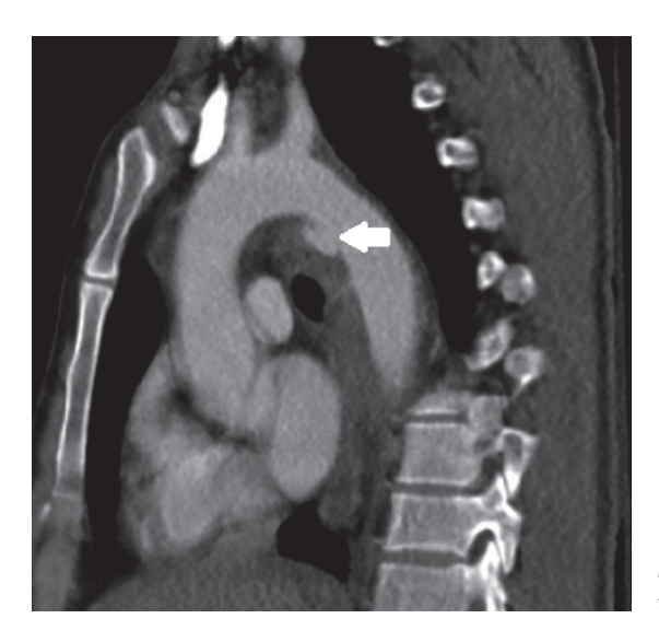
Figure 2 – Thoracic aortic rupture or transection (arrow) after car accident.

Of the 28 patients (71.5% males with mean age 32.8 years [min 19, max 73 years] and 28.5% women with mean age 50.8 years [min 25, max 84 years]), the cause of TAT polytrauma in 14 patients was due to a traffic accident (vehicle occupants), in 3 patients it was due to a motorcycle accident, 1 - pedestrian, 1 - ski accident, 1 - fall from the height of 5 m, 6 - fall from the height of 10 m, and 1 - fall from the height of 20 m (Table 1). In our group of patients, the average ISS score was 22 for women (min 19, max 27) and 26 for men (min 17, max 41), respectively. In our group of 28 polytraumatized patients referred to our Trauma Centre with current TAT (Figure 2), all 28 patients with such a thoracic aortic injury were treated